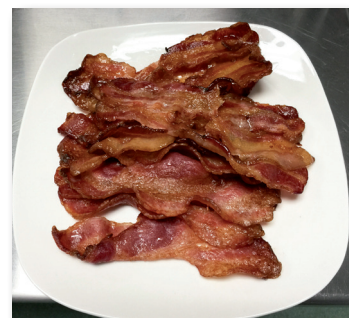
Bacon from Golden Bear Farm.

We continue to search for other local farmers who can provide sustainably raised poultry and beef.