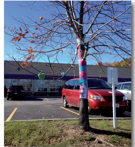
Knitted flowers also decorate the trees.