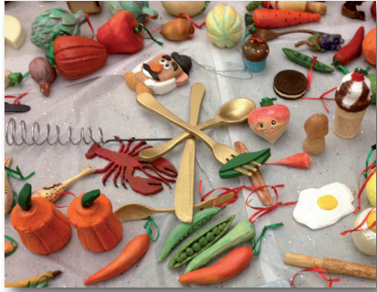
A few of the hand carved ornaments.

The 300 hand-carved wooden ornaments covered the