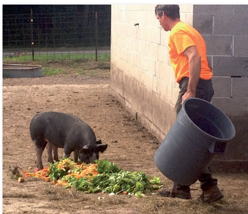
One Berkshire pig enjoying carrot scraps.

Our partnership began with Golden Bear Farm because they use sustainable farming practices: their pastures are certified organic and naturally fertilized. The animals are rotationally grazed on fresh pastures, have access to fresh air, fresh water, sunshine and space to exercise, making for very happy animals.