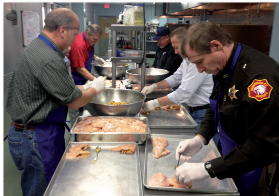
The officers had a great time working in the kitchen.