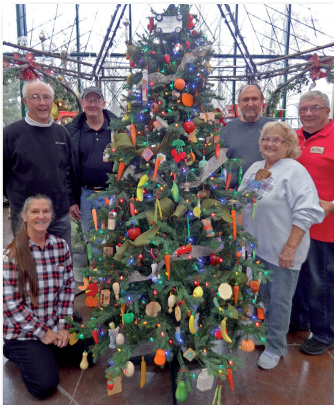
Kettle Karver Klub members pose with the decorated tree.